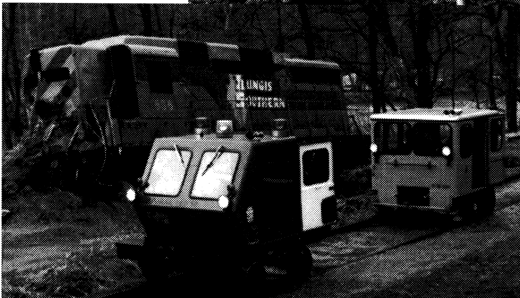
CN 140-50 pictured at the remains of the Fugitive train wreck. The loco is a former Southern EMD GP30.