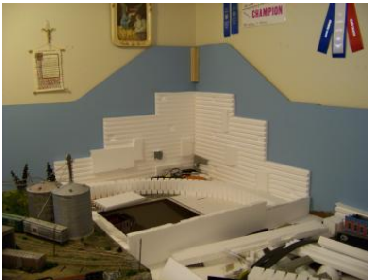
Here is a view of my mountain module before the profile is cut. Because of the module's height, I'll probably need to add some more support to it.

very solid construction. I know that wood is more durable and sturdy, but it also has a lot of weight associated with it. Here are some advantages that foam construction has over other materials: 1. No mess (well there is some mess, but no dust!) 2. Very light weight 3. Easy to fix mistakes 4. No expensive power tools needed 5. No complicated calculations needed to make raised track off the main base (radiuses are the easiest to make).