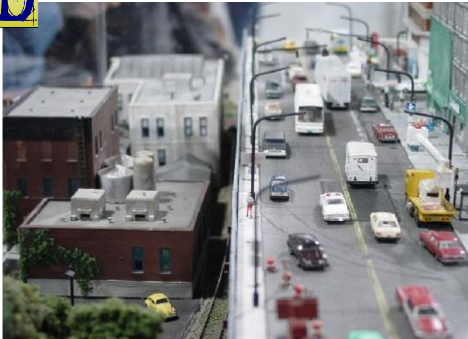
The devil's in the details. They can make or break a layout, especially an urban scene like this. Lots of action, without overdoing it, can really dress it up and draw lots of ooh's and ahhs.

Details, details, details. Nothing disappoints me more than to see a nicely detailed train rolling past a town of windowless buildings and empty streets (well except when they canceled Joan of Arcadia, but that's for another time). Save some of that money you would use on cab sunshades, and invest in your towns. Take some time to detail the structures. I find if you give the buildings a story, it's make the detail process a lot easier. Instead of it being just a generic storefront. Let it be a department store built in 1920, that closed in the 70's was divided-up and now serves as a trendy new nightclub with some spare retail space. Yes, I just came-up with that, and it's really quite simple. Most of it comes from the prototypes I see everywhere. That's where your inspiration should start. Check out the real things. What's on a city street, what's around a railroad yard, how is that factory laid out. Then get a story in the back of your mind. It need not be 100% accurate and can change at any-time. This method can also be applied to the streets and surfaces around that building.