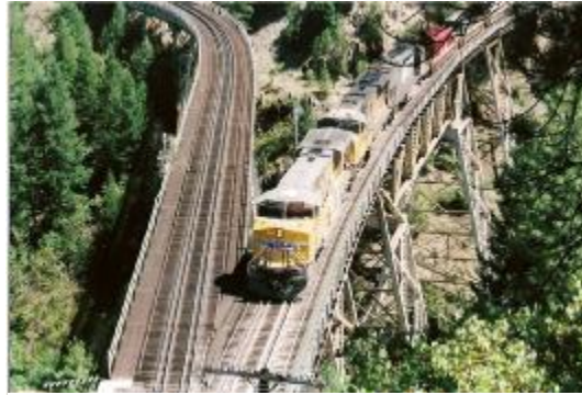
UP on the famous Keddie Wye.

Last time on the Shasta City and Bieber we followed the local crew from Shasta to Bieber and back on the lines two of three 4-axle units. Since then, there has been some added units. Three MP15DC's from the Southern Railway of British Columbia, a Southern Pacific U25BE #6800, and 3 Rio Grande SD40T-2's. The rail crews were very happy receiving some new locomotives. Today were going to ride along with a grain train from the interchange at Bieber to Shasta Yard. And then later we will join the yard crew for some fun at the Shasta Yard. The crew arrives at Bieber around 8:30am. They find the power is already been placed on the train. The unit consist is DRGW 5371/SPSF 9192/SSW 9387 (SD40T-2/SD45T-2/SD45T-2). With all of the air brakes checked the train starts to leave about 9:10am. As they leave town the air horn off of 5371 echo's throughout the sleeping town in a crisp autumn Saturday morning. The crew is making good time when all of the sudden there is a jerk and the train goes into emergency. The crew de-boards the train to figure out what has happened. They find that the 15 th car to the 20 th car has derailed. So the crew radios in that their train has derailed just out side of Hooper. The dispatcher tells the crew to take the locomotives and the first 14 cars and park on the Hooper Power plant siding. With this the line is blocked and has given the dispatcher a headache as he calls the local crew at