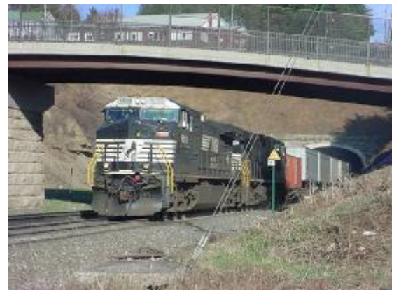
NS train coming out of the Gallitzin Tunnel.

WANT TO JOIN IN THE RANTING? THEN JOIN THE TAMR ONLINE GROUP AT YAHOO GROUPS.COM. SEE PAGE TWO FOR MORE INFO.