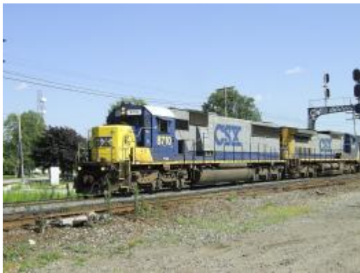
CSX 8710 seen Toledo-bound at Fostoria, OH, July 15, 2006.