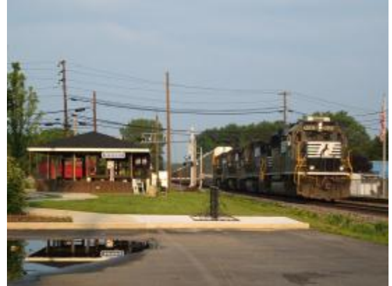
Norfolk Southern auto-intermodal train 212 heads east through Macungie, PA on a sunny July morning.