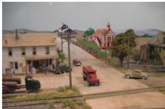
One of the many modular layouts at the show. Ho Scale display.

While me and Chris were anchored to the table (though Chris did take a suspiciously long bathroom break) everyone else came and went from the table throughout the show day, dropping-off purchases, or trying them out on the HO layout. Some read books they had purchased, while others would hang out for a bit, rest their feet then charge back into the sea of humanity looking for more deals. Believe me, there deals to be had at this show. This is, after all, one of the biggest train shows in North America (it has been second to Chicago as the nations largest in years past) and if you can't find it here, it probably doesn't exist. Everything from brass GEVOs to life-size Conrail number boards. Nearly every major manufacturer has a display showing off there up and coming products. Hobby shops from all over New England, and the Midwest come here. Then there's the layout's in every major scale from Z on up