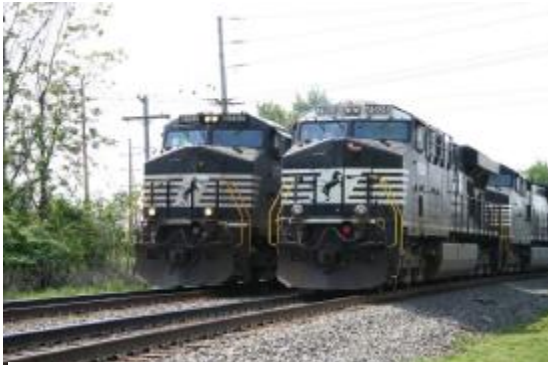
UPDNS Train #262 with D9-40CW 9707 passes stopped 24V with ES40DC 7504 at CP Belt.