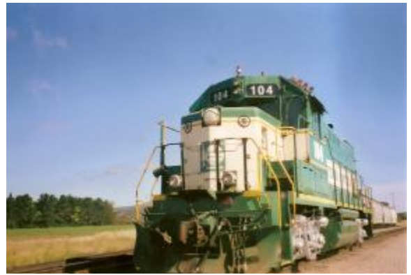
California Northern Railroad GP15-1 #104 pauses outside Lombard Yard near American Canyon, CA.