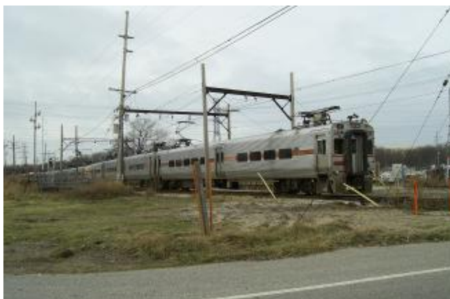
The end of a westbound South Shore commuter train leaves the street trackage through Michigan City, Indiana as an east-bound train waits to enter the same trackage.