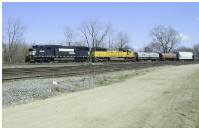
NS 6740 and UP 2217 lead a westbound freight west toward Chicago, at South Bend, IN.

The steel mills, refinery and other large industries are not only railroad customers, but very heavy users of rail transportation. Unfortunately, just as a strong railroad presence in an area has a tendency to drive down property value; heavy industry has an even stronger tendency to drive down surrounding property values. For this reason railfanning in certain areas east of Chicago is not something I'd recommend. The danger in getting into certain areas is not worth what you might catch, especially if you are not familiar with the areas you're getting into. Additionally, many of the largest railroad customers have heavily secured and guarded facilities which are not welcoming to railfans. Closer to South Bend and in some of the nicer Chicago suburbs are several safer locations to watch trains in, although common sense is required in these locations as well. ●