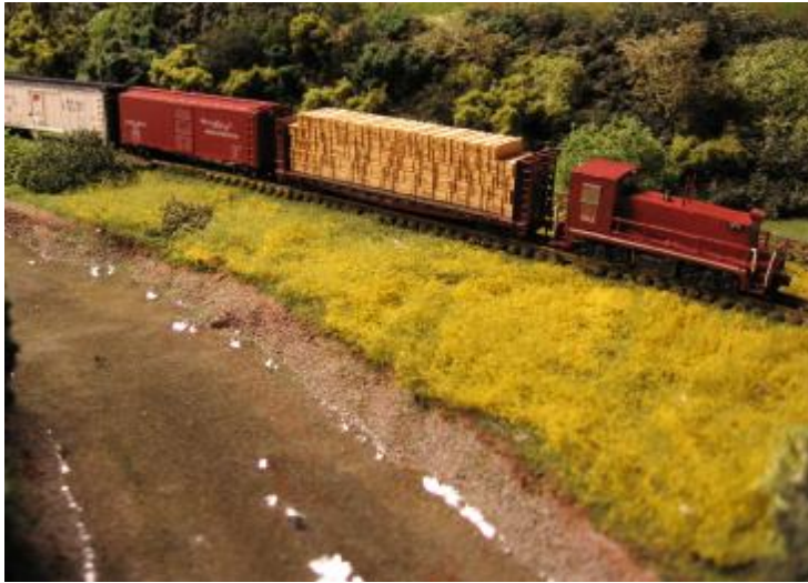
You can almost feel the warmth of summer as a little Whitcomb switcher rolls through a flowering meadow. Pine Creek is also running strong this season.

online Hotbox IN FULL COLOR! And while you're there, start your climb to