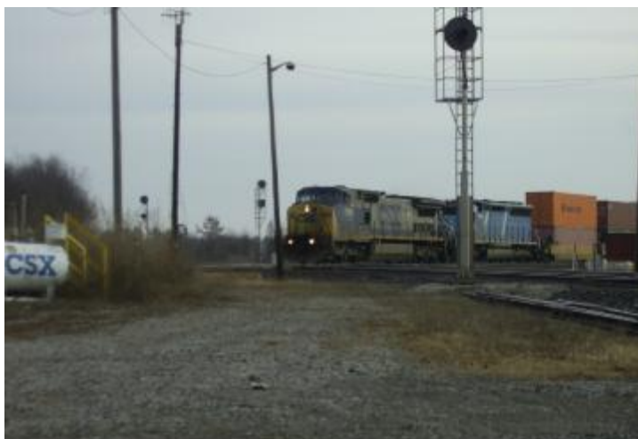
Westbound CSX at Wellsboro, Indiana.