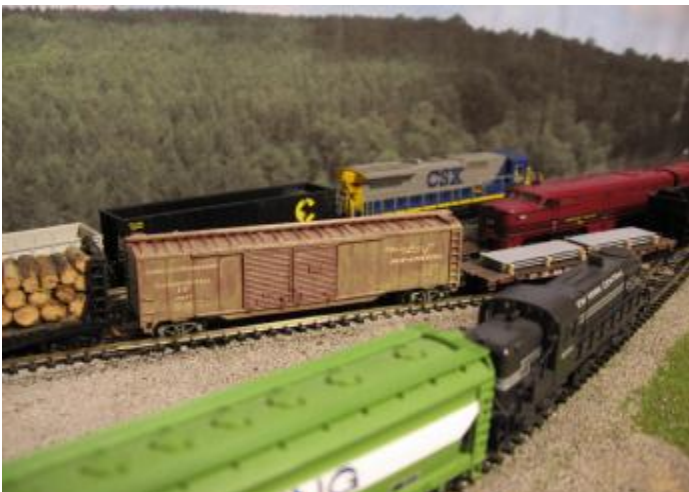
Heavy traffic near the Corning Glassworks! The NYC RS2 must wait for a mixed freight train to clear before proceeding into Wellsboro, but they'll be able to watch the CSX C40-8 and the LV PA-2s going about their coal and passenger service jobs, respectively.

An invitation to all members: If you'd like to write a layout tour, railfan trip story, how-to article, or just publish some photos, you can do so in Model Railroad News , where thousands of people will be able to see your work! Just contact me on the TAMR e-mail list, the TAMR.org forum, or at nazrrfan@excite.com . I'll gladly give you any help you need in order to present your work to the wider model railroading community and help you gain the admiration and envy of all your railfan friends! This is open to any member regardless of age or hobby interests (as long as it's train-related.) You never know if you might want to work for a train magazine or model railroad company one day, and writing in MRN will give you a jumpstart in the right direction. ●