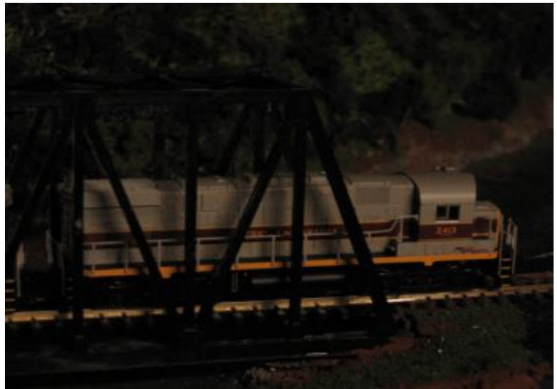
A pair of Erie-Lackawanna C424's navigates the bridge over Pine Creek in the last hours of daylight.