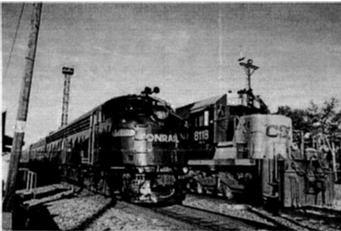
CSXT (ex-CR) #4022 and CSXT #8118 sit side-by-side in the yard in Huntington, WV. The OCS has just arrived and is splitting the train up for various destinations.