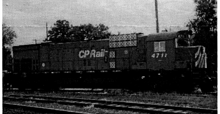
MNNR (ex-CP) #4711 still in it's old CP Rail paint scheme. Andy Inserra

non-industrial railroad) #316 and #318; and a RS20, #307 (also rare; one of only three units left). The units kept their old numbers on the MNNR. Next came a big GE -SF30C #50 (ex-950?, ex-ATSF). Also, they acquired a slug from NRE - #01. The MNNR has added to their Alco roster more recently when CP Rail retired its MLWs. Six ex-CP units have found their way to the MNNR. They are RS23 #80 (ex-#8031); M630 #73 (ex-#4574); RS-18's #81, #82 and #83 (ex-#1812, #1839 and #1837 respectively); and M636 #71 (ex-#4711). You may recognize the last two to work for CP Rail. They were retired by CP just this past July. M636 #71 is also well known. It was the last big Alco to operate on a Class I railroad in the USA and Canada (retired in late May or early June '98)!