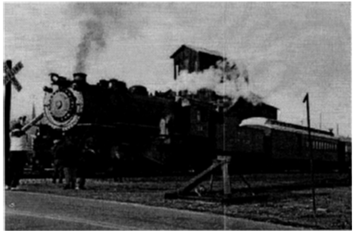
HVSR (ex-LS&I) #33 sits at the depot in Canal Winchester, Ohio. This is special run over the I&OC. Also, the 33 is the direct sister engine to WMSR #734 (ex-LS&I #34).